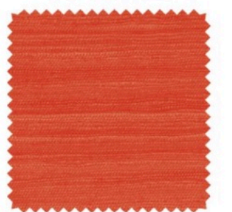
Orange silk taffeta pinch-pleat draperies from The Shade Store