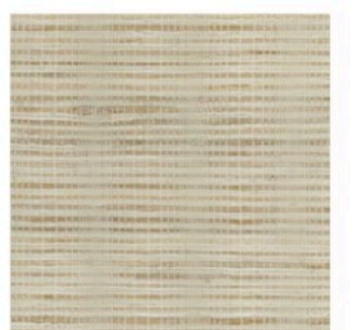
Woven wood shades from The Shade Store